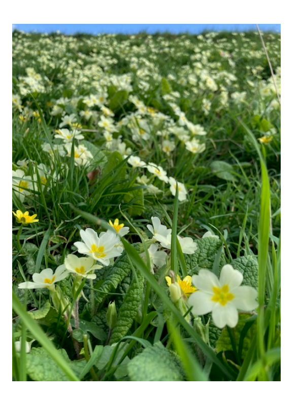
A warm hello from the PlantWild team It's now an ideal time to plan ahead in the garden with Easter just around the corner, and longer days to be outdoors.

Our new season wildflower stock has been growing on over recent weeks.