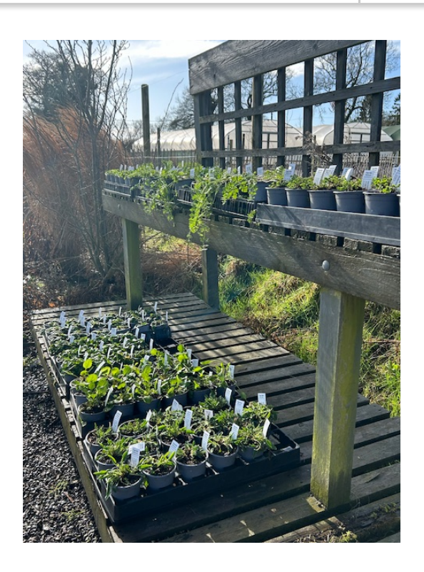
Visit The Blooming Wild Nursery