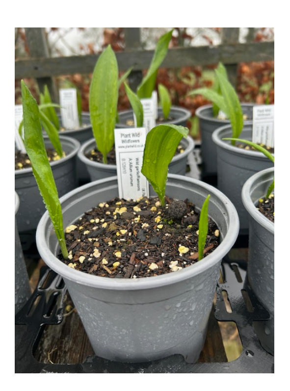
Buy Wild Garlic