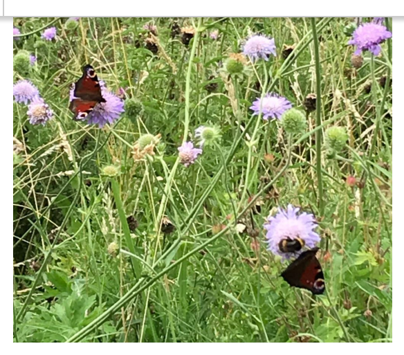
Browse all our collections