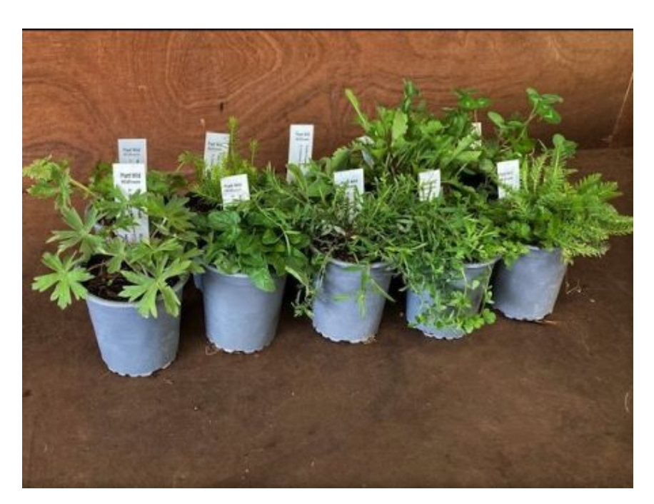
The Garden meadow collection consists of 10 x 9cm pots for planting outdoors to flower in 2023

NEW to our collection range is the Garden meadow collection . A selection of 10 x 9cm pots of wildflowers to start your own little Garden meadow. Including Birdsfoot trefoil, Knapweed, Ox eye daisy, Meadow vetchling and more.